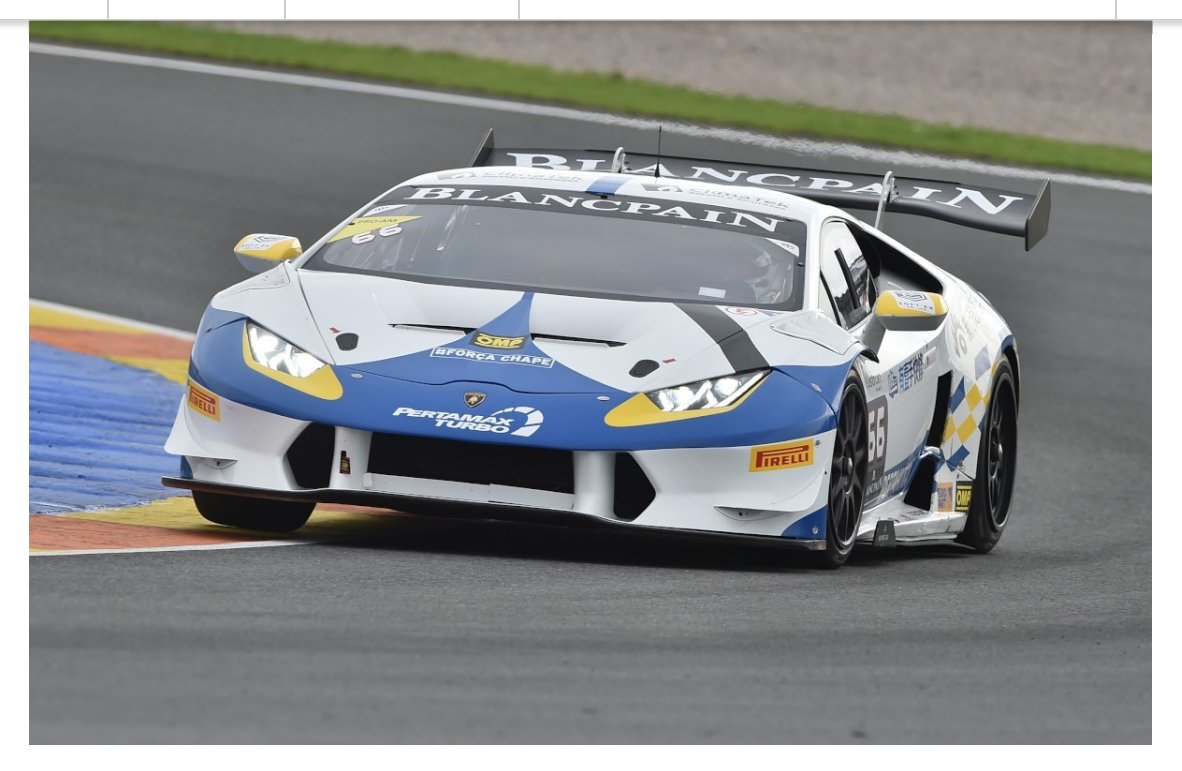
Liang and Costa scored two podiums at Valencia

The Am's raced by themselves for the first time at Valencia and Krenzia made a clean get away at the start of race one, maintaining 6th place. On the second lap he passed Hassin for 5th and from then on the top five pulled away. Barely six seconds covered them when the pit stop window opened and Krenzia was one of the first to stop. A lap later his main championship rivals ducked into the pits and when the window closed Krenzia was running in 4th but a spin on lap twenty with eighteen minutes to go pushed him down to 8th. One of the fastest drivers on the track in the closing stages Krenzia caught up to the leaders and passed Bartels for 7th but couldn't make up further places with the time left on the clock. With his main Championship rivals finishing ahead of him he slipped to 3rd in the Championship.